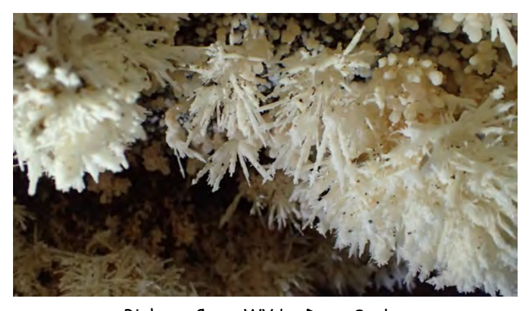
Bighorn Cave, WY