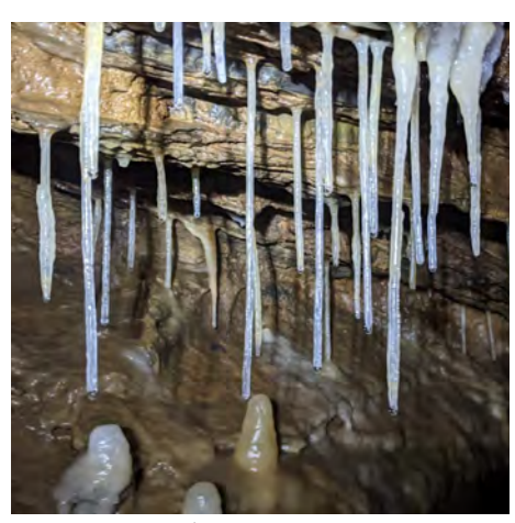
Dry Cave soda straws - Dave Socky

Fred Grady's Obituary can be found at the following <u>link</u>.