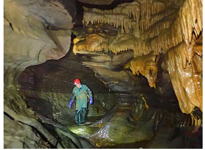
Culverson Creek Cave, WV