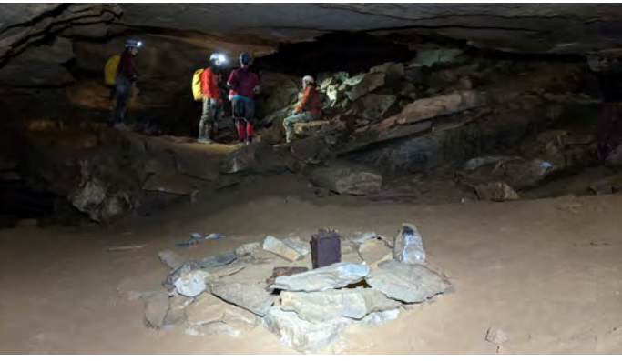
Stuff left over from the good old days (1950's) in Floyds Lost Passage.

showed Maggie where their team was going to survey. Then climbed we down into a stream channel and into the Flat Room and then Floyds Lost Passage. We went past Mud Avenue and the junction for the B Trail and finally to McClures Slop