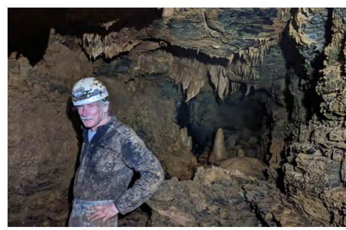
There were some formations - just past the dome-pit.