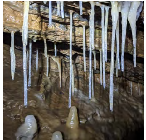
Dry Cave soda straws - Dave Socky

Fred Grady's Obituary can be found at the following link .