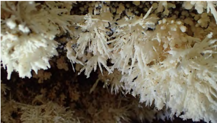
Bighorn Cave, WY