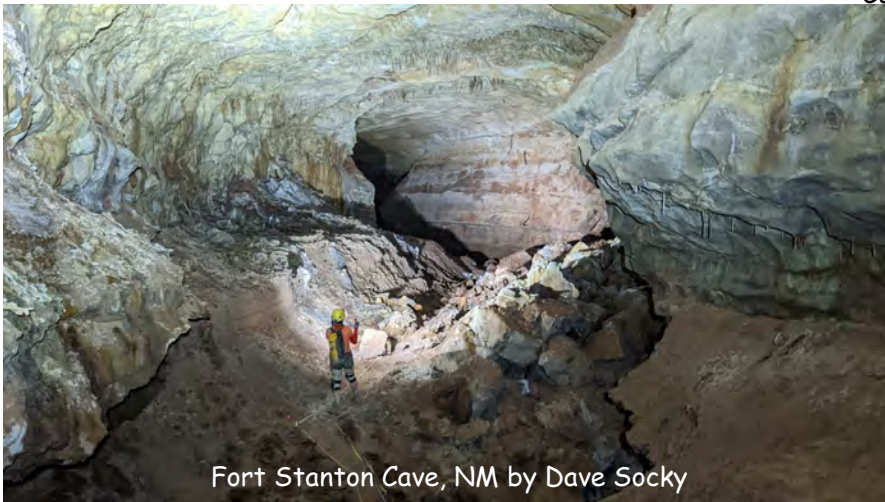
Fort Stanton Cave, NM