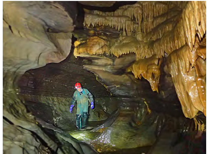
Culverson Creek Cave, WV